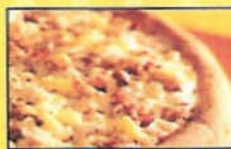
Hawaiian BBQ Chicken