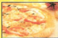
Spinach Alfredo Chicken Tomato